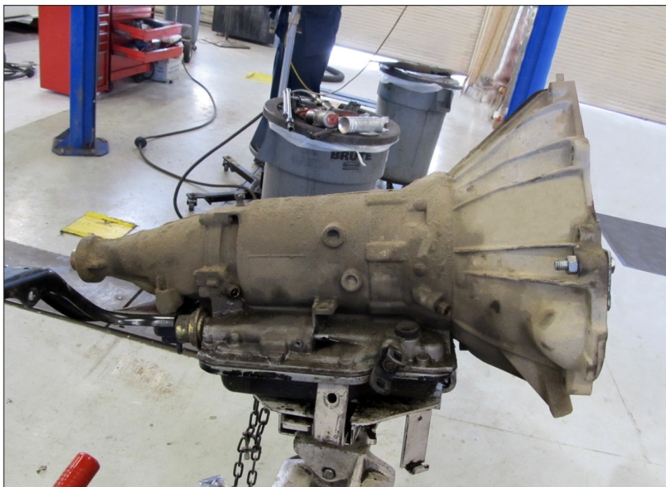
Figure 1: A Removed Remanufactured Transmission at a USPS Vehicle Maintenance Facility